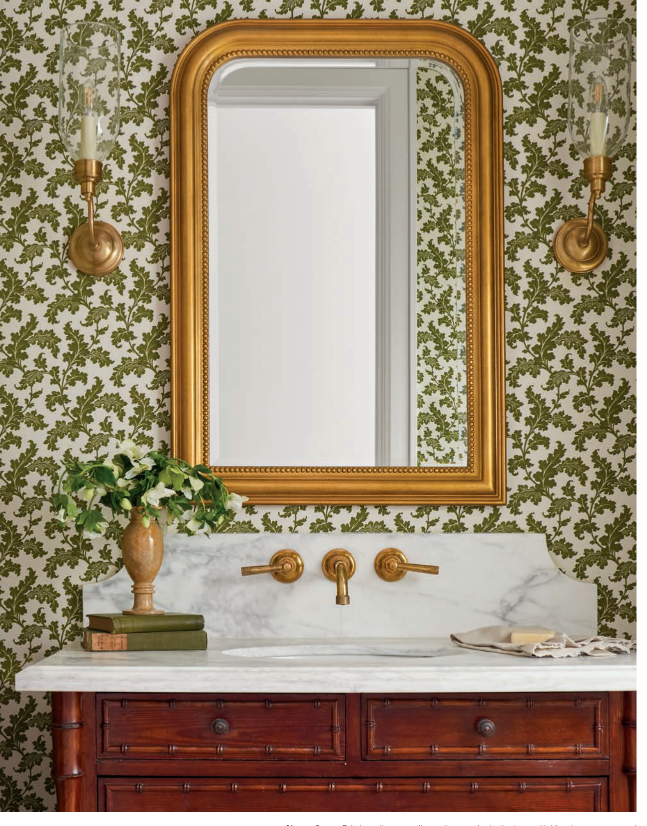
Above: Soane Britain wallpaper enlivens the powder bath along with Vaughan sconces and a Made Goods mirror. The vanity from Jessica Lev Antiques is fitted with a Calacatta Caldia marble countertop and backsplash and a faucet from Westheimer Plumbing & Hardware.