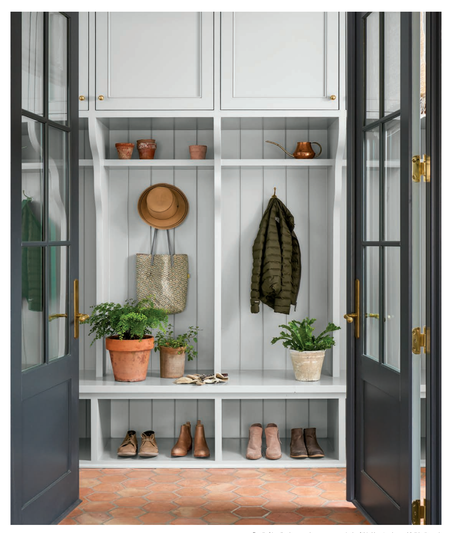
Family-friendly charm underscores every inch of this Houston home. Visible through double doors by Sierra Pacific Windows, the mudroom boasts terra-cotta tile flooring from Material and custom storage in Sherwin-Williams' Magnetic Gray.