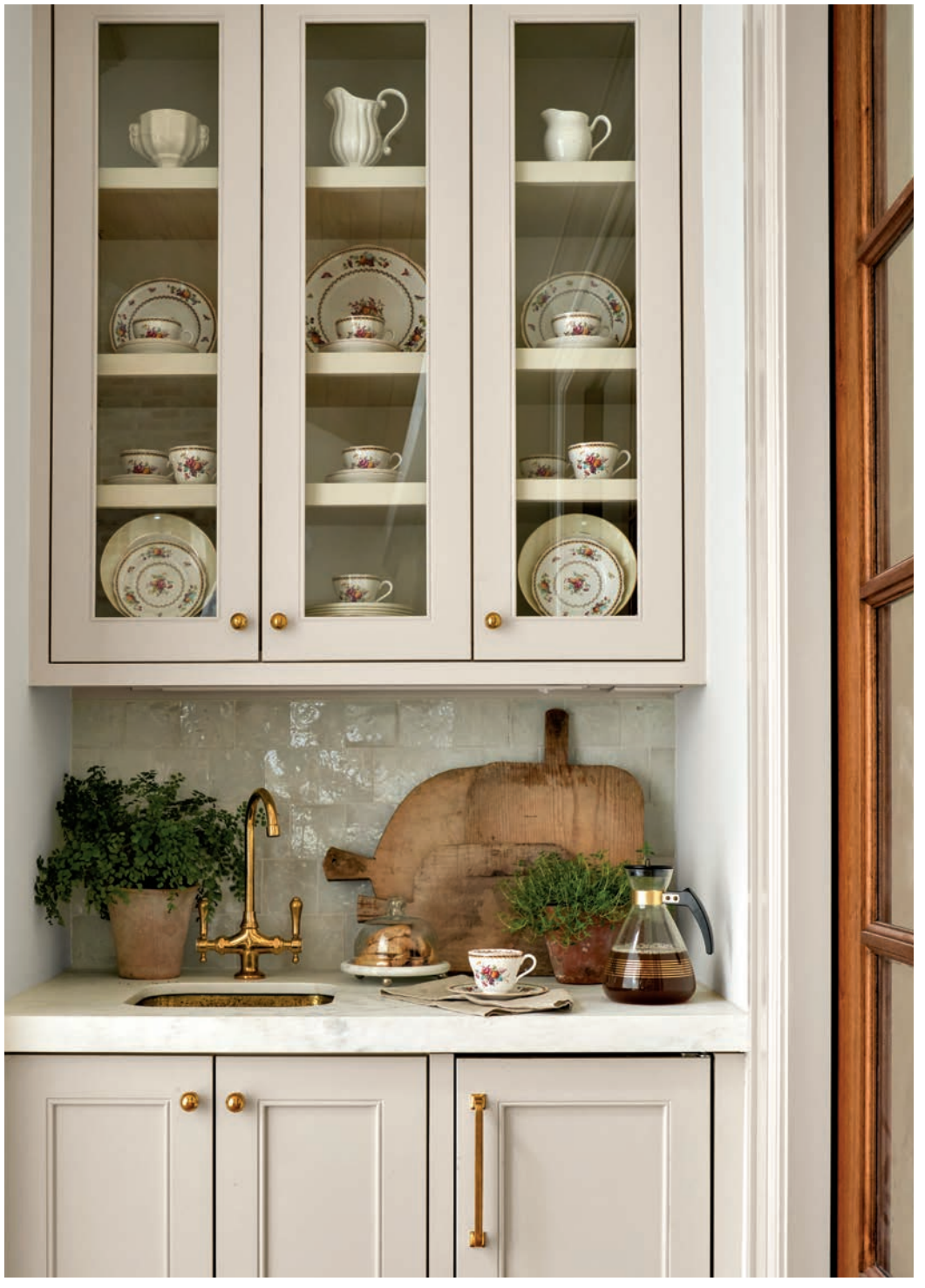
Above: Painted Benjamin Moore's Edgecomb Gray, the kitchen bar cabinetry complements a clé zellige tile backsplash. The Newport Brass faucet and Rejuvenation hardware add a subtle glimmer.

Left: Jasper's Indian Flower wallpaper forms the dining room backdrop. Louis XVI-style consoles from Jessica Lev Antiques mix with an RH dining table and wicker chairs from Mainly Baskets Home. The pendant drum shade and chair cushion upholstery use the same Carolina Irving Textiles print.