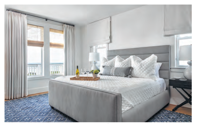
The primary bedroom has a view of the ocean.