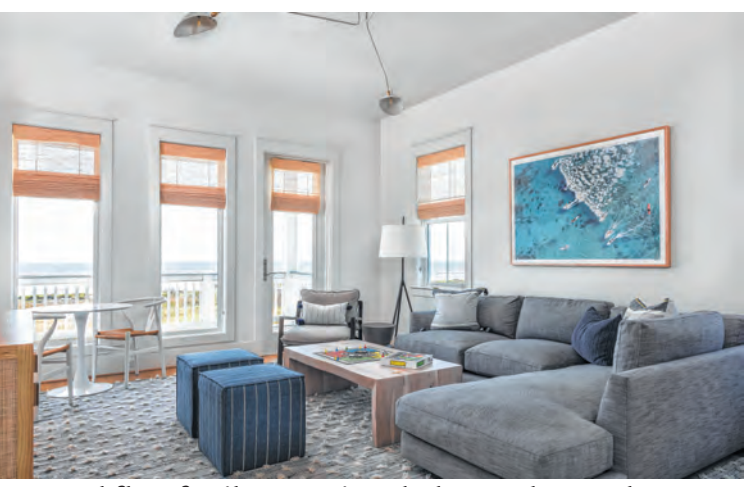
A second-floor family room gives the boys a place to play.