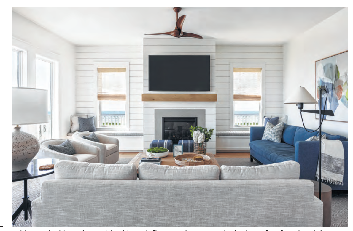
A blue-and-white palette with white oak floors and seagrass shades is perfect for a beach house.